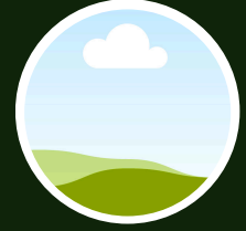
NAME ANNOUNCED SOON