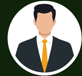
NAME ANNOUNCED SOON