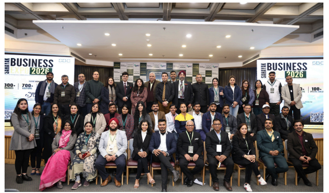
SAHAYAK BUSINESS EXPO | DATE: 10 JAN 2026