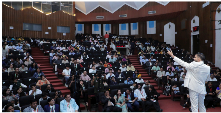
SAHAYAK MSME & DIGITAL GROWTH SUMMIT DATE: 06 SEP 2025