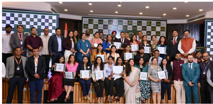
SAHAYAK BUSINESS MEET | DATE: 24 AUG 2024