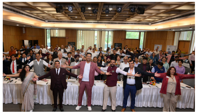
SAHAYAK STARTUP SANGAM | DATE: 14 JUNE 2025