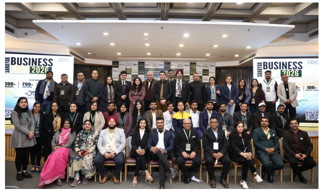
SAHAYAK BUSINESS EXPO | DATE: 10 JAN 2026